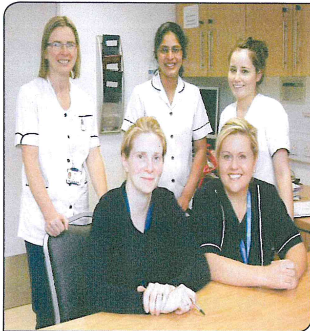
The Nenagh Medical Team

The local Injuries Unit (LIU) treats minor injuries in patients aged 5 years and older. You can self refer to the LIU or your GP can refer you.