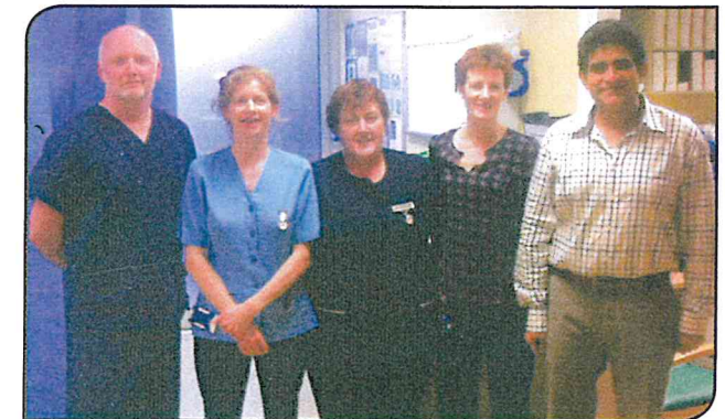
The Nenagh LIU and MAU Team

If you require emergency assistance call 999 or 112.